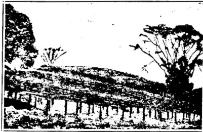
A young Kweme Nut plantation.

In the last four years several planters in the Western Usambara Mountains have taken up the cultivation of Kweme nuts, and the first plantations are now in bear-