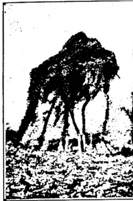
[Native method of growing Kweme Nut.

The Oyster or Kweme nut ( Telfairea pedata ) is indigenous to Eastern Africa. It is a tall climbing plant with a slender woody stem, reaching a height of 50 to 60 feet. It is dioecious, the male and female inflorescences being borne on separate plants. The fruits or gourds have several marked ridges along their length, and attain a size of 1½ to 2 feet or more in length, and about 8 in. in thickness.