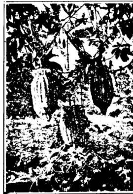
Gourds of the Kweme Nut.

The nuts are utilized for confectionery purposes, being palatable either fresh or roasted as a table nut or in the making of sweets and cakes. They may also be used for pickling or be converted into soups. An analysis of the nuts shows the fibrous husk to be 11 per cent by weight, the shell 38 per cent, and the kernel 51 per cent. The husk contains an intensely