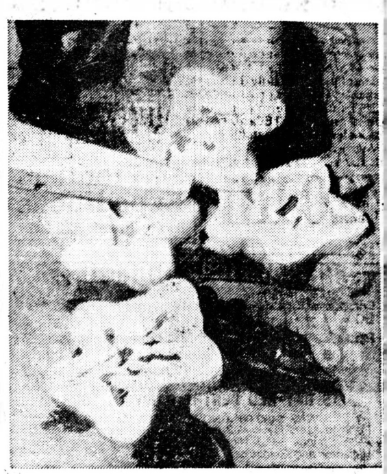
The exotic babace

Babaco is an ornamental plant. Like other sub-tropical fruits, it makes a great garden display and produces an exotic addition to the table.