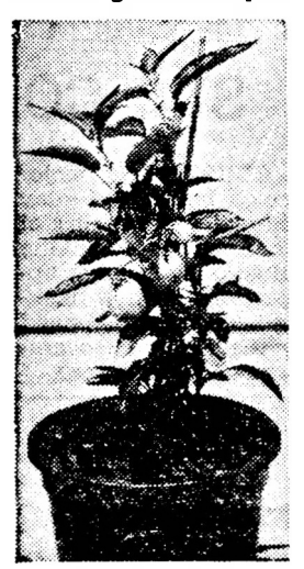
A pepino plant.

The Nurserymen's Association of WA has released Pepino Temptation and it will be available through garden centres, nurseries and garden shops.