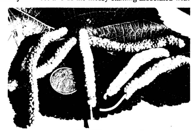
Shahtoot fruit may be 100 mm long